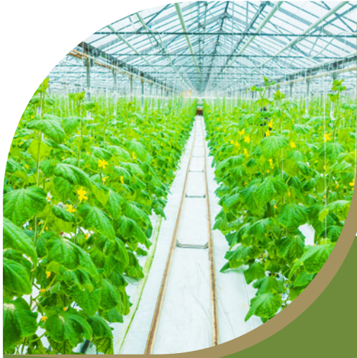
Best Agricultural Project

Technology and innovation, human capital, and scientific research are considered the most vital pillars for overcoming the challenges confronting the agricultural sector. For this reason, the King Hamad Prize for Agricultural Development has been divided into three categories: